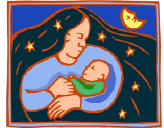
Visit the BOND website at: http://www.arizonabond.org/